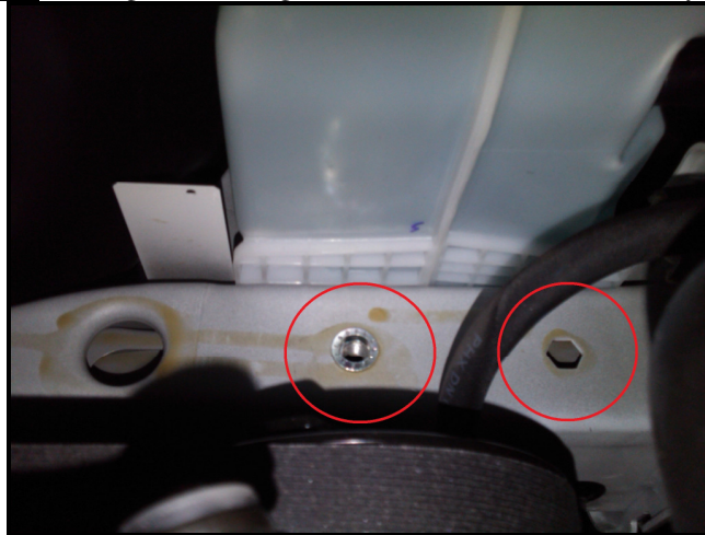
Picture B: Passenger side hexagon holes with one rivet nut already installed.

Now you will want to have your driver with 12" wobble head extension and 17mm socket on the end ready to go. Take your assembled rivet nut tool and insert the rivet nut into one of the hexagon holes in the frame. Next take your driver and tighten the bolt to a minimum of 25 lb-ft. Make sure that the head of the rivet nut stays tight and flush against the frame. Also before tightening the bolt, the rivet nut tool will need to be held in place so it does not turn. This can be done by hand or aligning the tool so it butts up against part of the car. When you have finished tightening to 25 lb-ft, start to remove the bolt while holding the install tool making sure it does not turn. Completely remove the bolt and install tool so the rivet nut is the only piece of hardware left seated in the frame. The rivet nut should be tight in the frame and not able to rock or spin. Follow the same steps to install the second rivet nut.